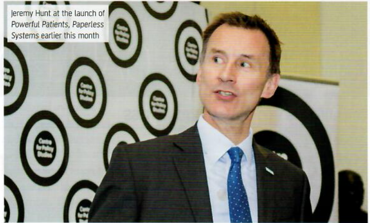
Jeremy Hunt at the launch of Powerful Patients, Paperless Systems earlier this month